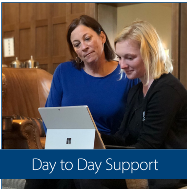
Day to Day Support