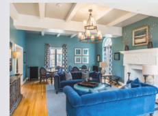
Alpha Xi Delta University of Wisconsin