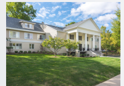
Gamma Phi Beta University of Michigan