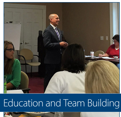
Education and Team Building