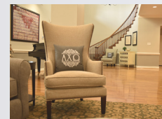
Alpha Chi Omega Texas A&M